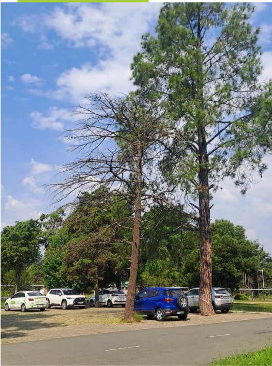
Image 30 Tree removal