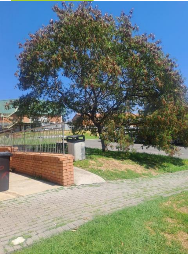
Image 47 Crown lifting