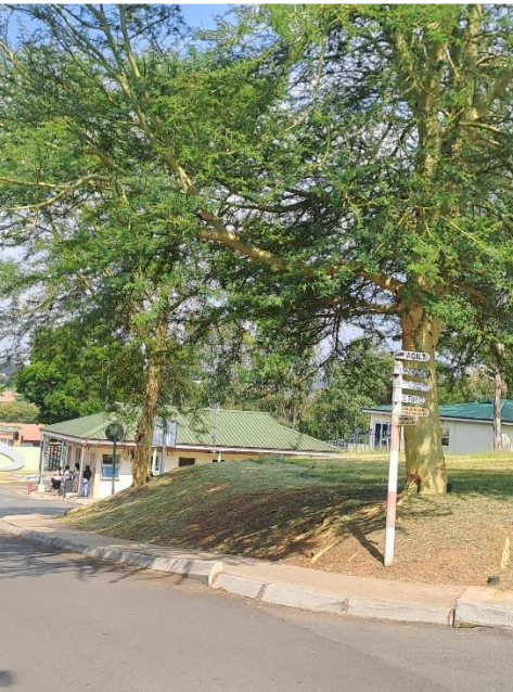
Image 44 Crown lifting