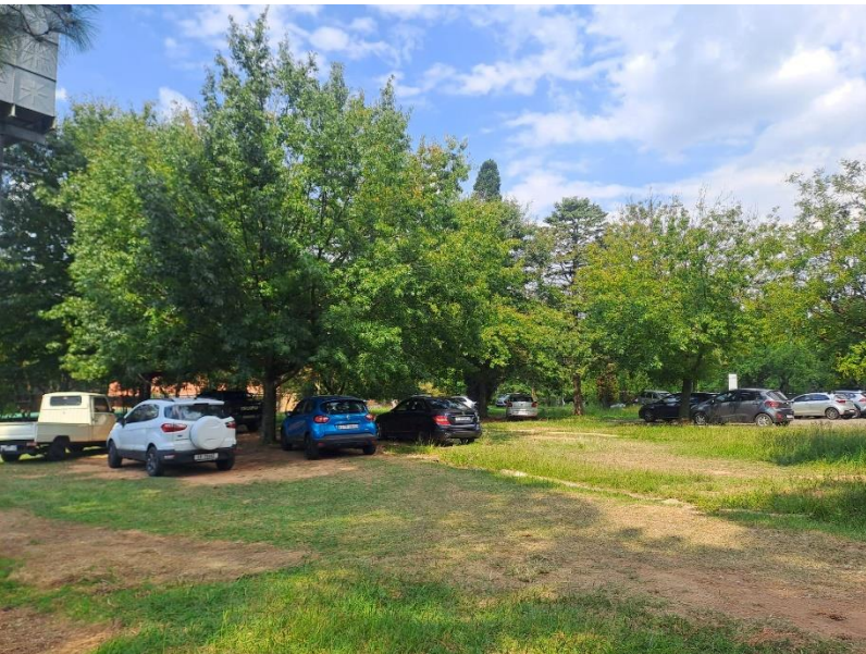
Image 22 Crown lifting