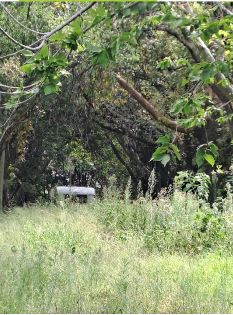
Image 28 Crown lifting