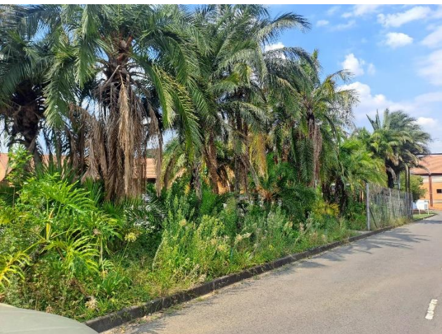
Image 39 Cleaning of dead leaves