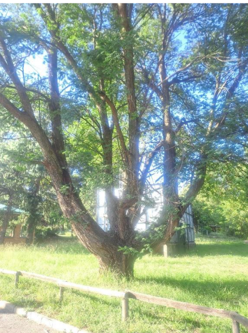
Image 4 Crown lifting