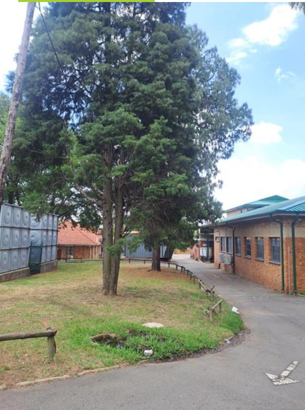
Image 3 Crown lifting