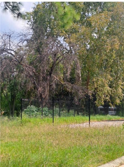
Image 31 Tree removal