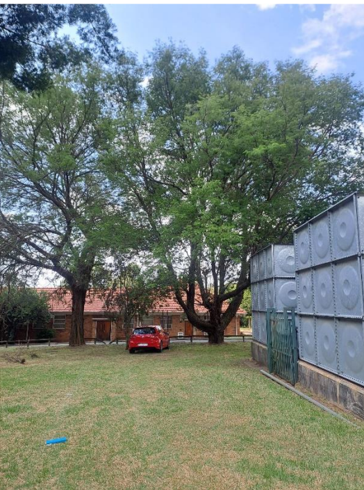
Image 20 Crown lifting