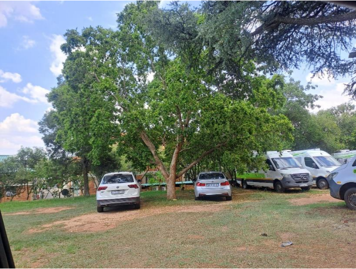
Image 26 Crown lifting