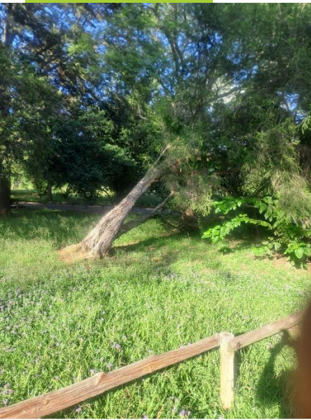
Image 7 Tree removal