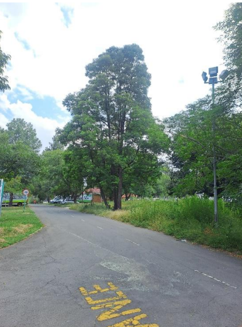
Image 18 Crown lifting