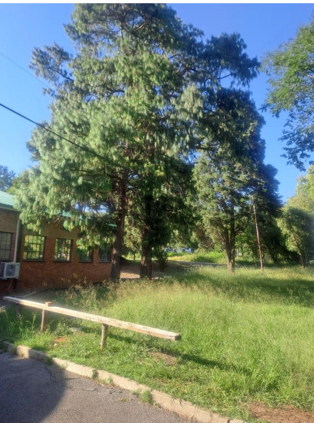
Image 2 Crown lifting