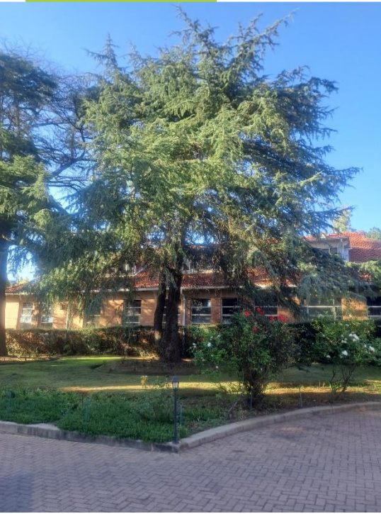
Image 17 Crown lifting