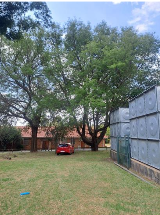
Image 8 Crown lifting