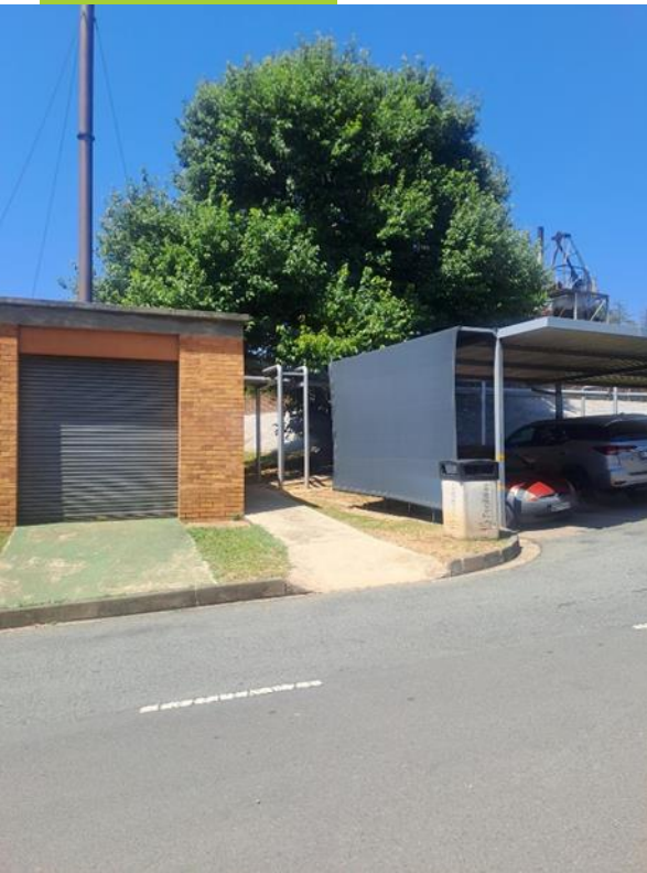
Image 40 Crown lifting