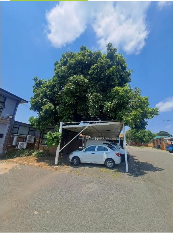
Image 11 Crown lifting