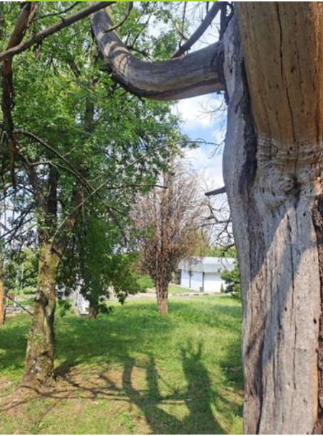
Image 34 Tree removal