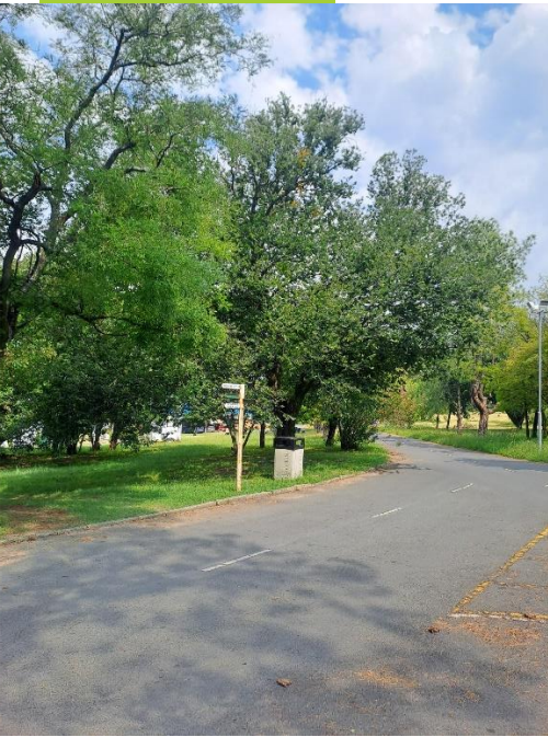
Image 32 crown lifting