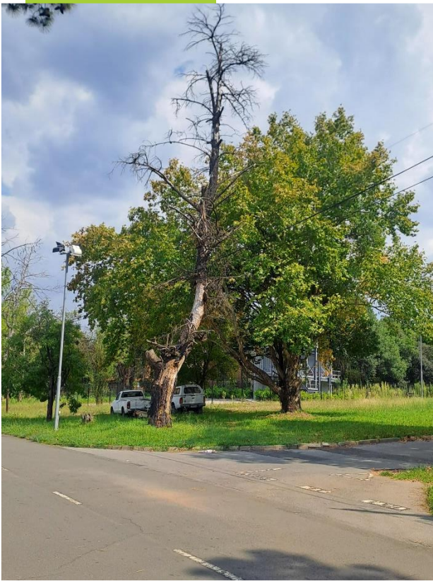
Image 21 Tree removal