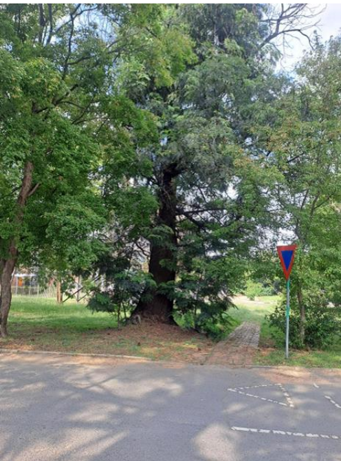
Image 35 Crown lifting