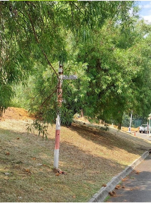
Image 43 Crown lifting