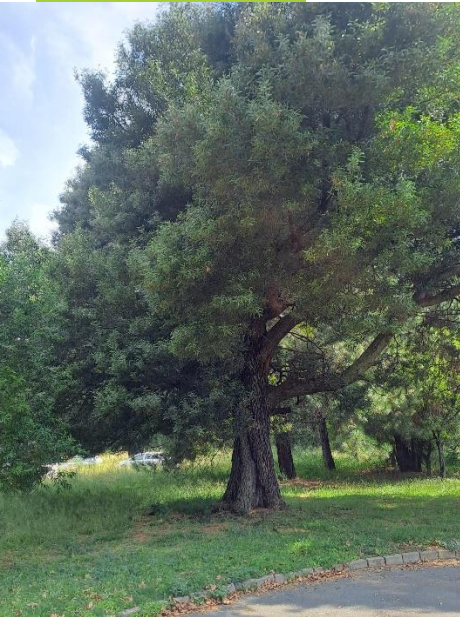
Image 23 Crown lifting