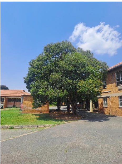
Image 14 Crown lifting