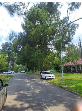
Image 25 Crown lifting