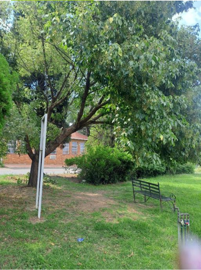
Image 38 Crown lifting