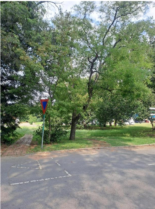
Image 29 Crown lifting