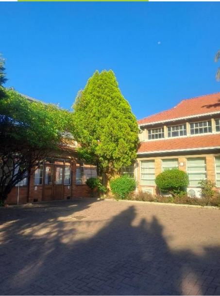
Image 15 Tree removal