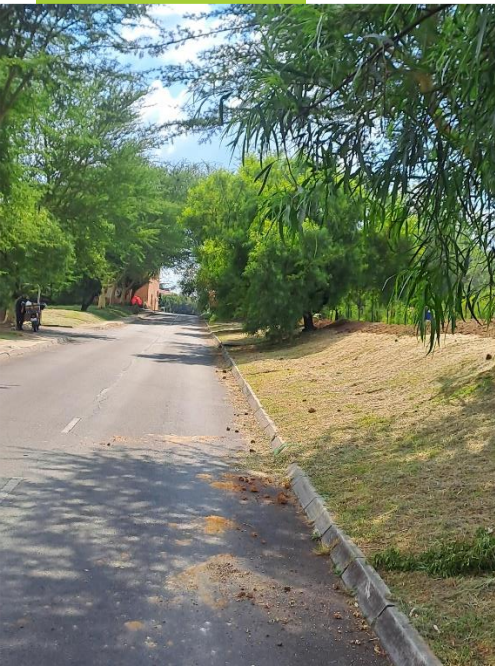
Image 45 Crown lifting