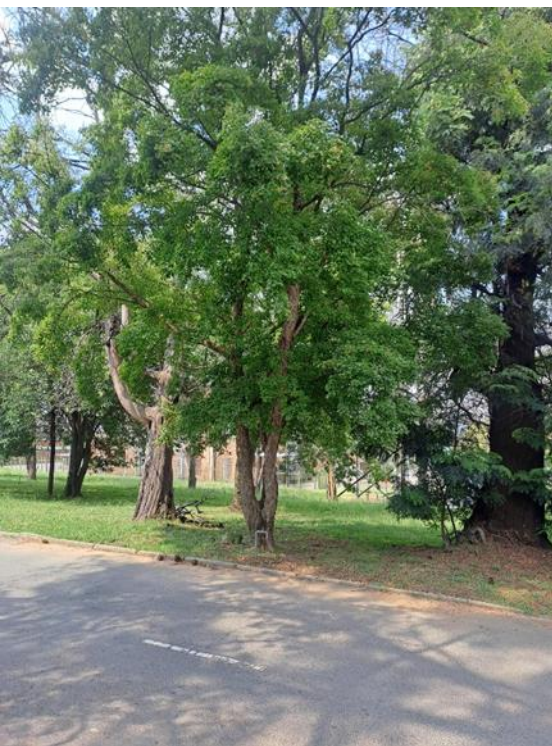
Image 33 crown lifting