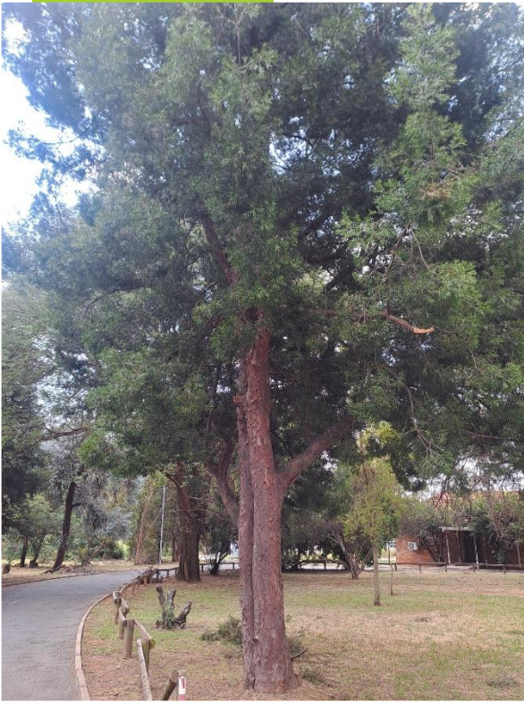
Image 9 Crown lifting