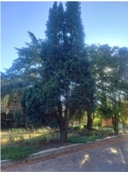
Image 16 Tree removal