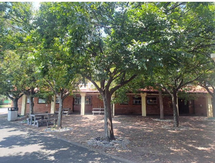
Image 10 Crown lifting