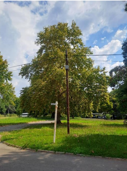
Image 24 Crown lifting