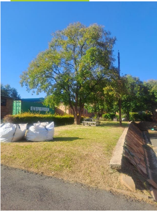
Image 1 Crown lifting