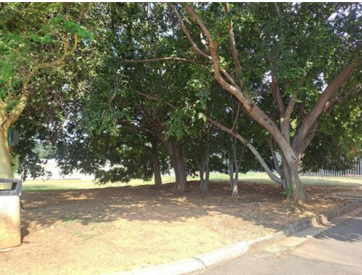
Image 42 Crown lifting