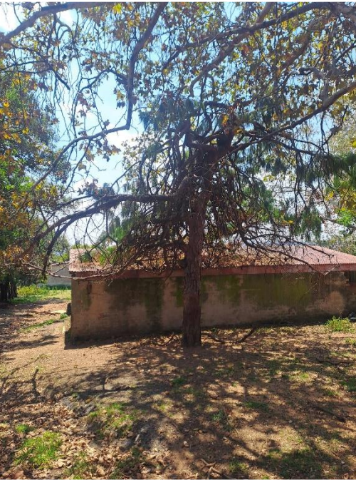
Image 12 Tree removal