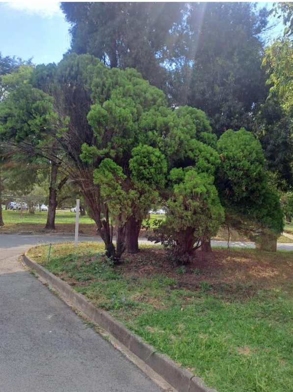
Image 37 Tree removal