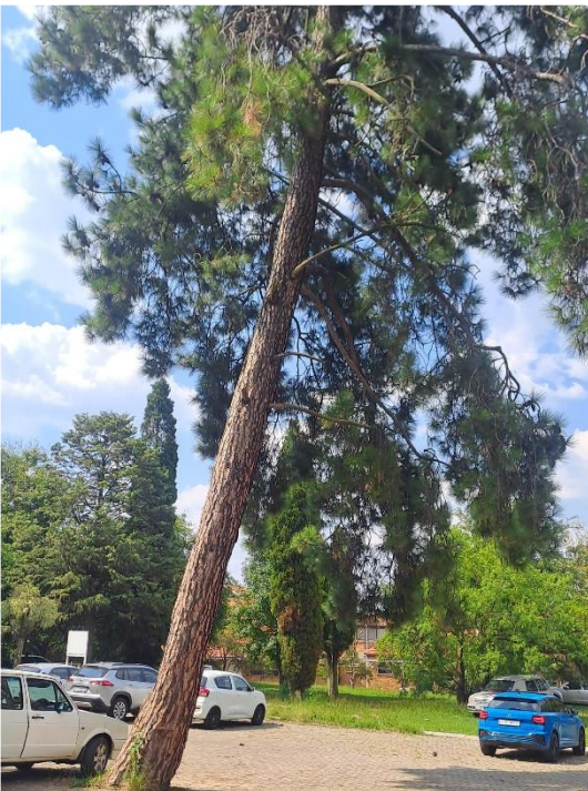
Image 27 Crown lifting