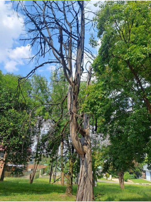
Image 36 Tree removal