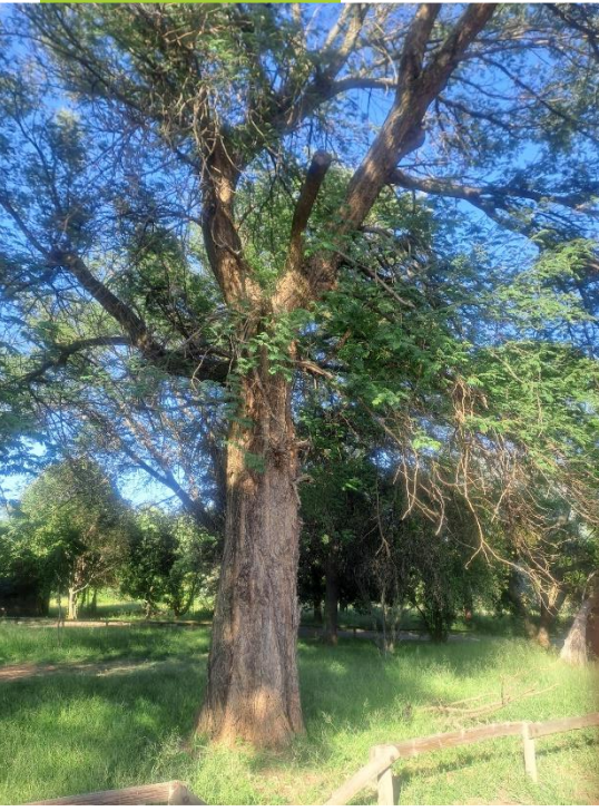
Image 5 Crown lifting