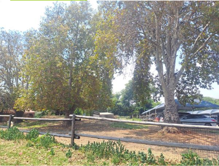
Image 13 Crown lifting