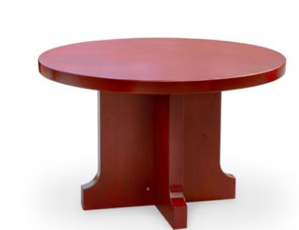
Figure 4- Round Table (with 4 leather inlays)