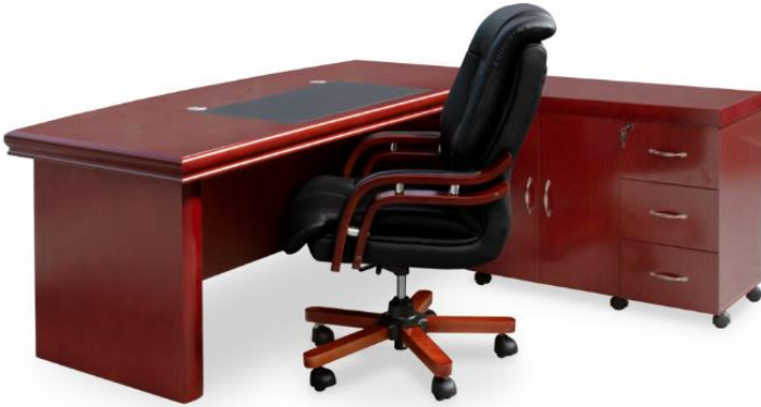
Figure 1- Chair only x 1

Designed for discerning leaders, the Management Desk boasts an expansive work surface measuring 1800mm x 900mm x 760mm. This generous area provides ample room for spreading out documents, accommodating multiple monitors, and managing your daily tasks with ease.