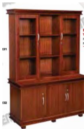
Figure 3- Filling Cabinet x 1

Top unit: 2 door glass hinged door and 1 open cabinet