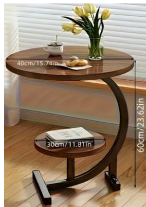
Figure 7- Round side table double layer small coffee table x 1