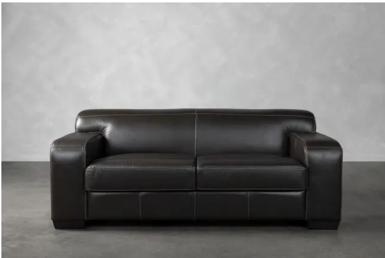
Figure 6- 2-Seater Leather Couch x 1