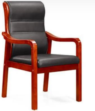
Figure 5- Visitors Chairs x 4