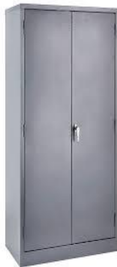
Heavy Duty Stationery Cupboard