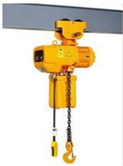
2Ton Electric Motorized Hoist