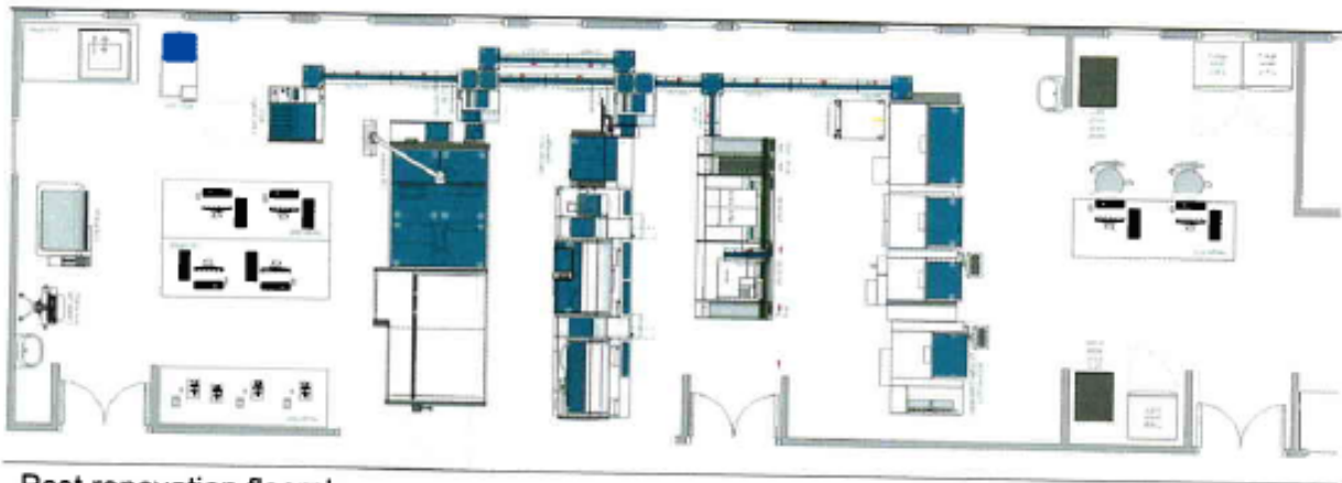
Post renovation floorplan