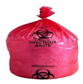
Figure 1: 80 Micron Red Plastic Bags

The supplier shall provide impermeable, tightly sealed containers or 80-micron red plastic bags together with a securing mechanism (e.g. cable ties) large enough to contain all the garments to be laundered. There should be sufficient containers or plastic bags, clearly marked with a biohazard label as depicted in picture below (Figure 1), as required by the Regulations for Hazardous Biological Agents and will be delivered to the facility for their use with each delivery.