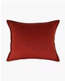
Tweedle Weave Scatter cushion 60cmx60cm x 2

Image not available Dwarf Juniper Bonsai entry-level (4 yr old) juniper x 1