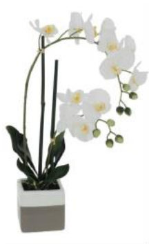
Artificial Orchid x 1