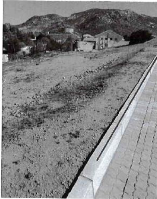
Access point from upper road