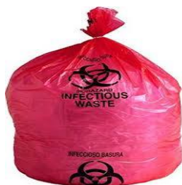
Figure 1: 80 Micron Red Plastic Bags

The supplier shall provide impermeable, tightly sealed containers or 80-micron red plastic bags together with a securing mechanism (e.g. cable ties) large enough to contain all the garments to be laundered. There should be sufficient containers or plastic bags, clearly marked with a biohazard label as depicted in picture below (Figure 1), as required by the Regulations for Hazardous Biological Agents and will be delivered to the facility for their use with each delivery.