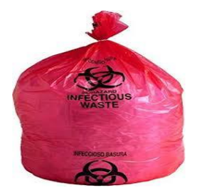
Figure 1: 80 Micron Red Plastic Bags

The supplier shall provide impermeable, tightly sealed containers or 80-micron red plastic bags together with a securing mechanism (e.g. cable ties) large enough to contain all the garments to be laundered. There should be sufficient containers or plastic bags, clearly marked with a biohazard label as depicted in picture below (Figure 1), as required by the Regulations for Hazardous Biological Agents and will be delivered to the facility for their use with each delivery.