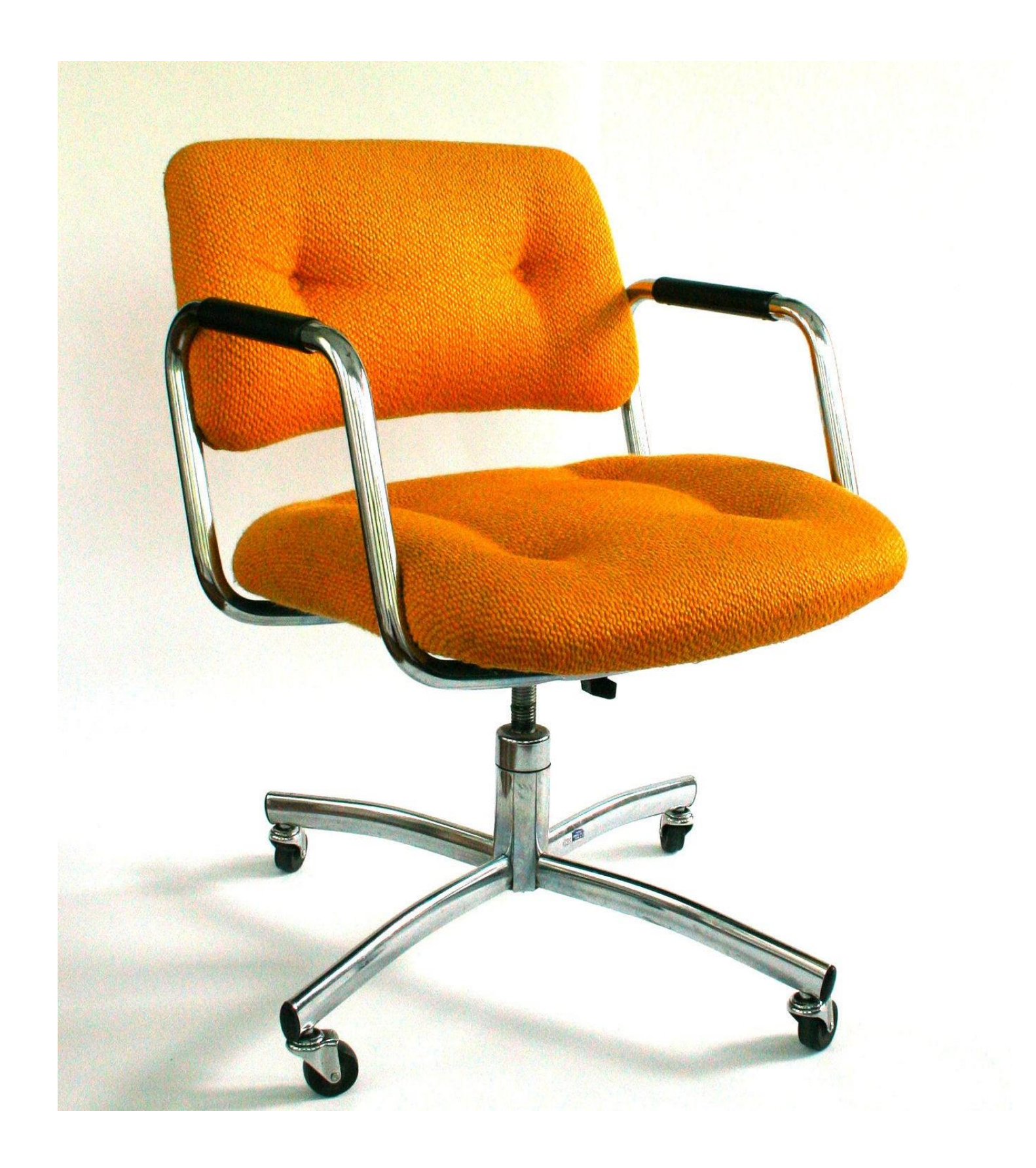
3.ORANGE VISITORS CHAIRS WITH ARMS AND CHROME INTEGRAL FRAME x 15.