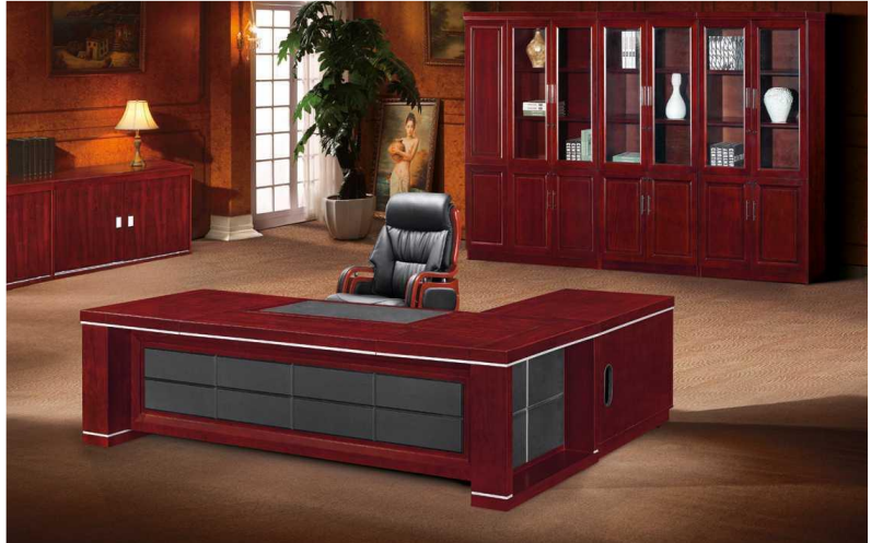
Credenza size: 1200Lx 750Wx 800W, desk: 22200 Lx 1200Wx 800H, colour: mahogany Veneer