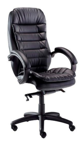
Visitors Armchair (Chair 1)