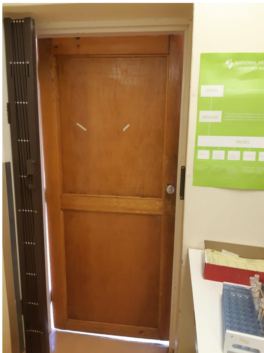
NHLS STANDARD SPECIFICATION

Bidder must tick comply or not comply and provide supporting documents where specified (failure to do so will lead to disqualification).